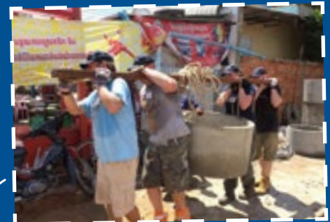
More positive energy!

Working hard and successfully, finding friendships, learning cultures, enjoying the Cambodian food, playing with beautiful children, bringing happiness and a new future to a special family.