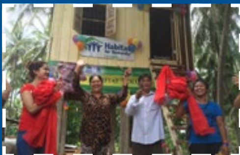
Another house inaugurated! Another happy family!

“They were so happy and grateful. Eyes in disbelief, tears of joy, a dream come true! We were tired but satisfied.”