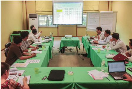
HFHC staff discuss low cost home design options

HFH Cambodia Construction Supervisors led a quarterly construction workshop, focusing on developing low-cost housing design options, identifying obstacles faced during the construction process, and maximizing volunteer effectiveness during construction. Participants from HFHC projects and Volunteer Program teams explored cost estimates and strategies for maximizing results, with a particular emphasis on working out how to provide low-cost and affordable housing options for people living with or affected by HIV/AIDS, as well as orphans and vulnerable children.