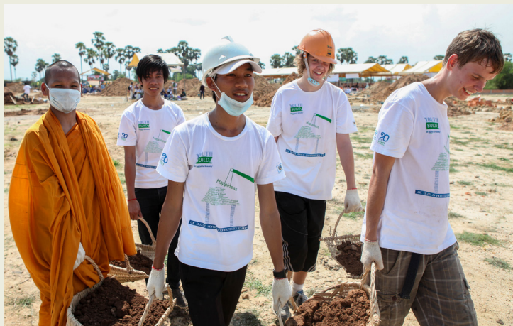
Participants from 2013 HYB at Smile Village

Habitat for Humanity Youth BUILD 2014 is a movement to raise awareness of the terrible poverty housing situation in the Asia-Pacific region and grow support for the vision of a world where everyone has a decent place to live. It calls for concerned young people to take action together to build homes and communities, on a Habitat build site and online through their social