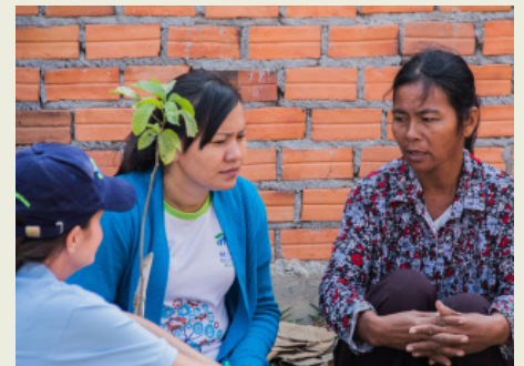
HFH Staff interview a Smile Village home partner