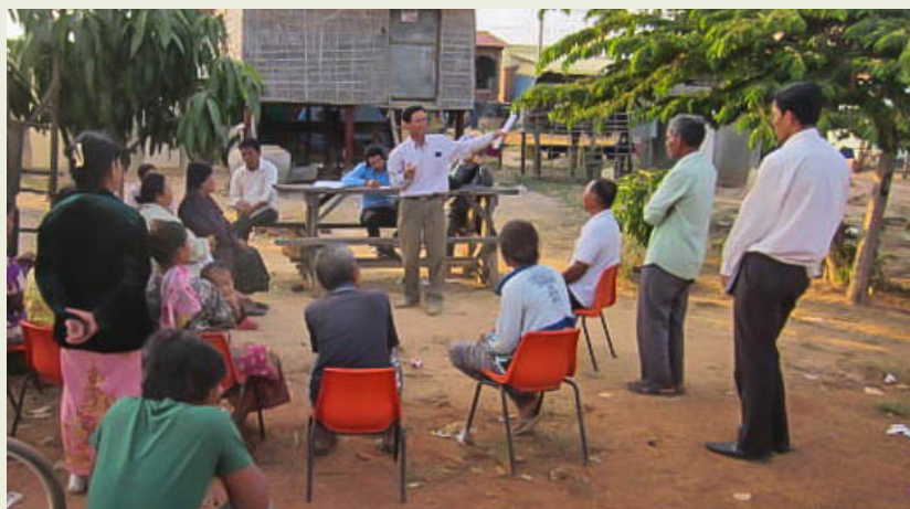
Siem Reap staff members meeting with residents of Veal Thmey