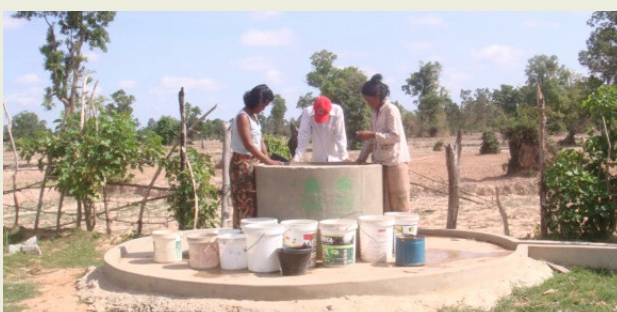
Buckets in line waiting to fetch water from a well in Angkor Chum, Siem Reap

Access to clean water is a human right that allows Cambodian households to be more productive. Without clean water, rural Cambodians will continue to be burdened by water-borne or water-related diseases, escalating their spending of their meager income on medical expenses, which leads them further into poverty and overall lower rural economic productivity. Habitat for Humanity's mission is to improve the welfare of poor families by providing them with sustainable, decent, and affordable housing solutions - including access to water.