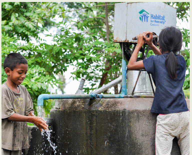
Access to a reliable, clean water supply can make all the difference for a community

Join Habitat Cambodia in serving more families with clean water to enhance their productivity and improve their living conditions.