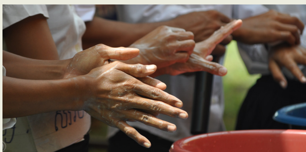
Youth hygiene training activities

In villages like Kauk Chan, we are expanding our program investments in life-saving water solutions to improve families' earning potential.