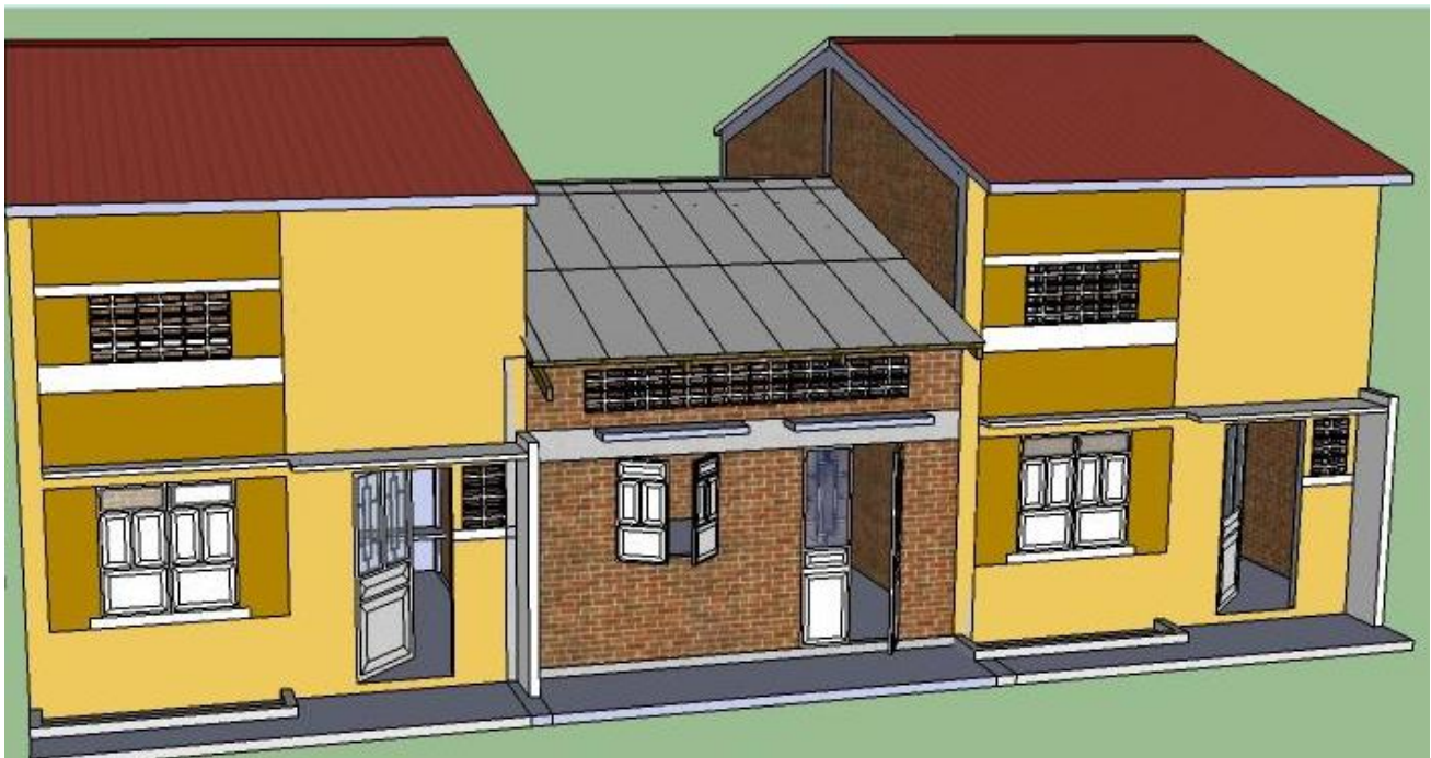
Design approved by the government

The 15 houses will be built primarily using Compressed Earth Blocks (CEB), a building material that is made mainly from damp soil compressed at high pressure to form blocks. The CEB technology has been developed for low-cost construction, as an alternative to adobe to promote the use of eco-friendly construction materials within communities. The houses are within the 82 plots of the social concession land.